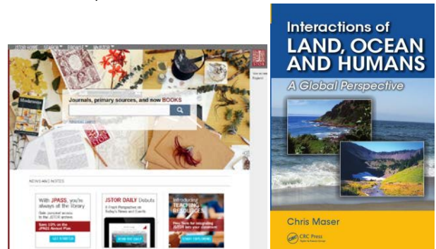
Above left: JSTOR, a database available from the Library; Above right: one of the available eBooks; On right: one of many streaming videos.