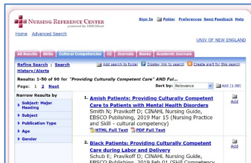
Nursing Reference Center