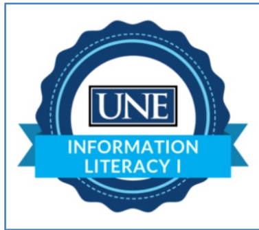
Information Literacy Digital Badge on Credly

UNE Library Services now offers an information literacy digital badge through UNE's Credly and Blackboard sites. Encourage your students to earn this badge to strengthen the quality of their work throughout their time at UNE and beyond by developing their skills and habits of mind related to source evaluation and information literacy (as described by ACRL's Framework for Information Literacy in higher education http://www.ala.org/acrl/standards/ilframework ).