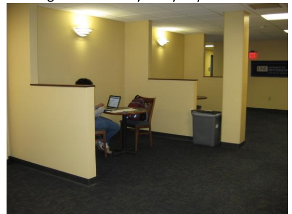
Renovated lower level at Ketchum Library

Phase I of the Ketchum Library Project has been completed. This phase upgraded student study spaces, relocated four library staff offices, constructed five new group study rooms, plus increased and improved the seating space in the Library lower level and the Windward Café. Phase II will begin later in the spring semester and will convert the main entrance of the Ketchum Library to include a new art gallery space and to completely reconfigure the Library entryway.