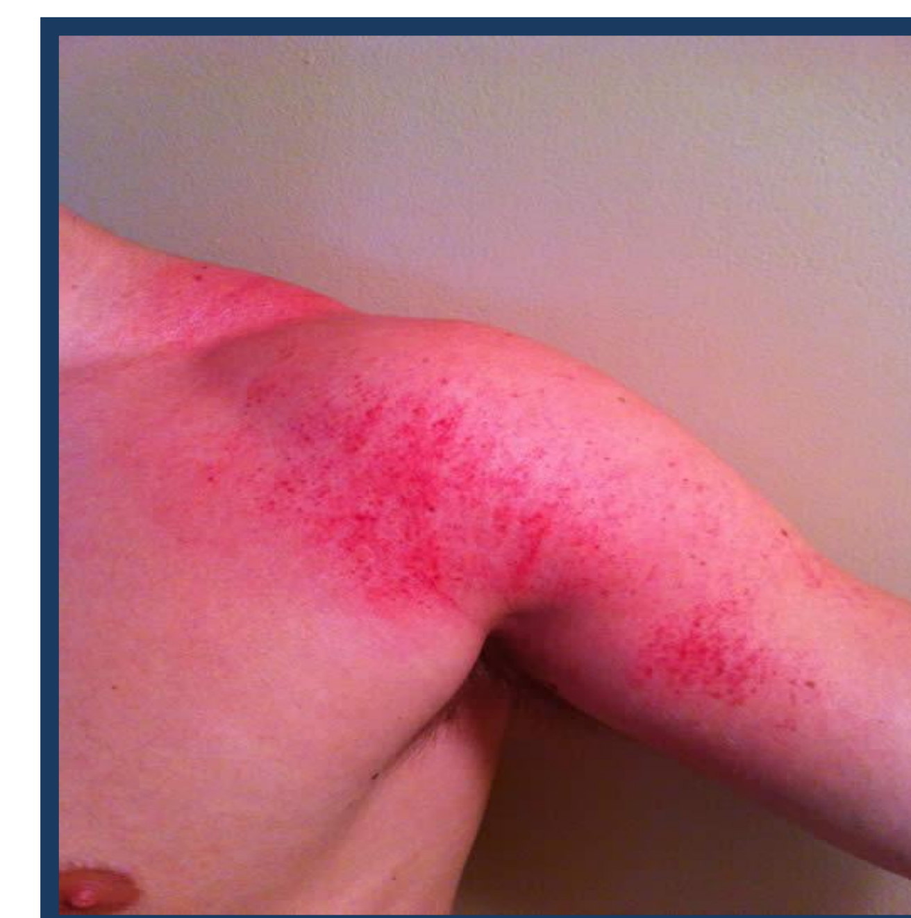
Figure 2: Petechiae following a Sound Assisted Soft Tissue Mobilization Treatment (SASTM®) treatment