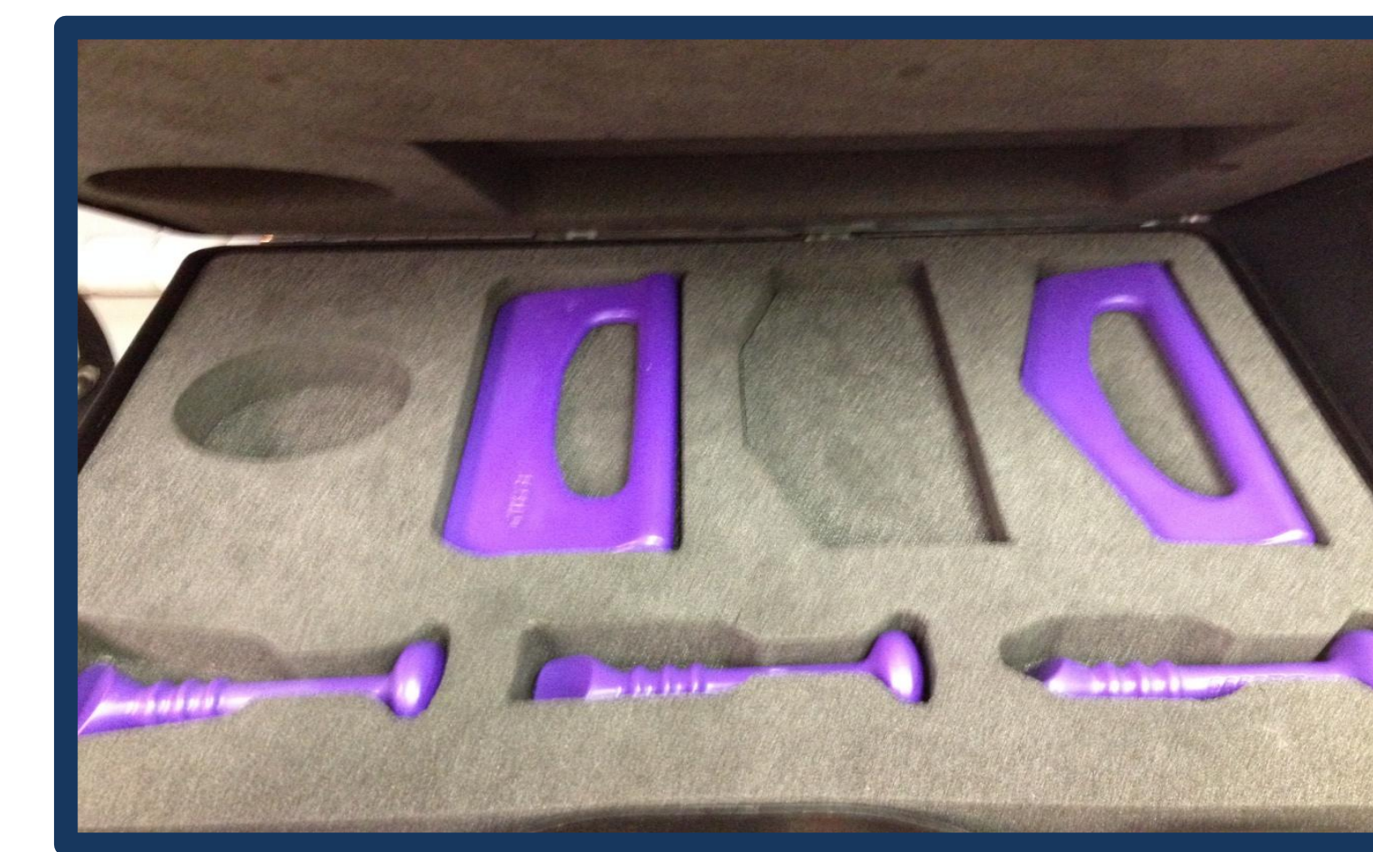
Figure 1: Sound Assisted Soft Tissue Mobilization (SASTM®) tools available at the clinic. Top Row left to right, Tools #6, and 4. Bottom row, left to right, Tools #3, 2, and 1.